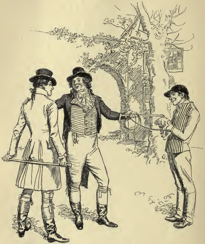
Offered him one of Folly's puppies.